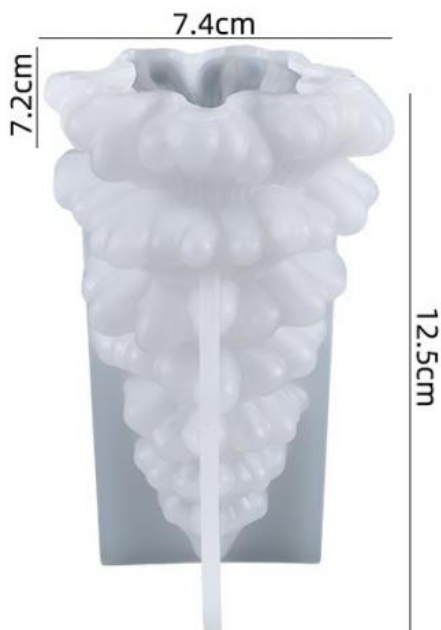
高度：12.5cm 成品尺寸：6.9*6.8*12.2cm 立体圣诞树模具02