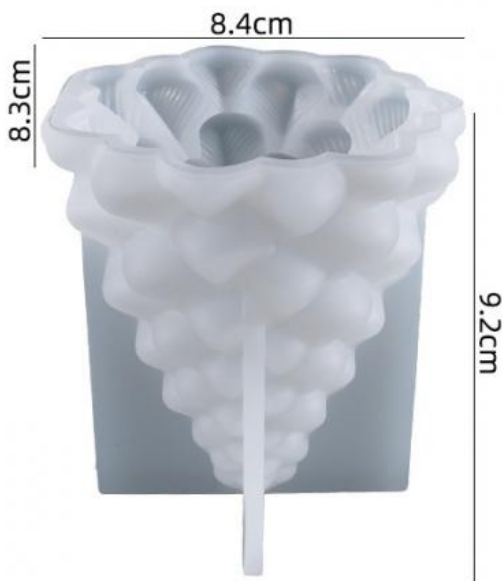
高度：9.2cm 成品尺寸：7.9*7.7*9cm 立体圣诞树模具01