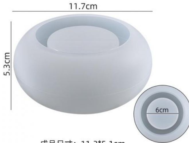
成品尺寸: 11.2*5.1cm 盆栽硅胶模具01