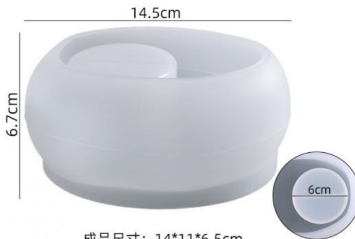
成品尺寸: 14*11*6.5cm 盆栽硅胶模具02