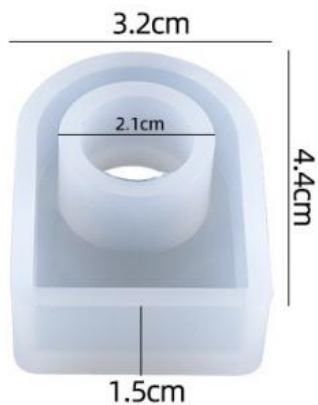
厚度: 1.5cm 成品尺寸: 2.6*3.8*1.2cm 戒指硅胶模具