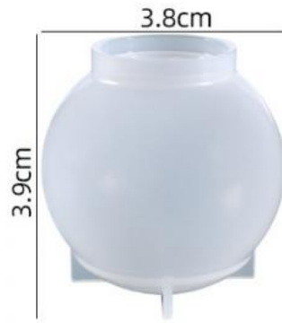
成品尺寸: 3.5*3.5cm 一体圆球模具35mm