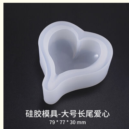
硅胶模具-大号长尾爱心 79 * 77 * 30 mm