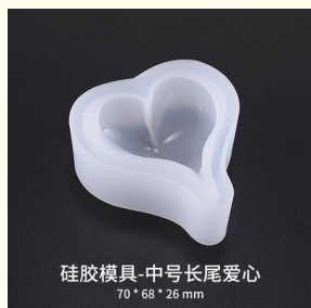
硅胶模具-中号长尾爱心 70 * 68 * 26 mm